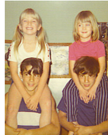
Cousins from Calif.