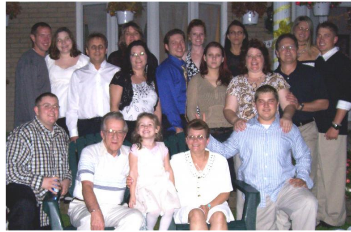
it just doesn't look right