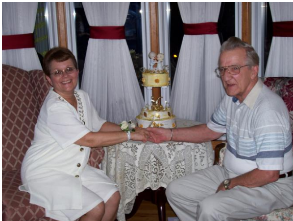
MOM & DAD miss you so much