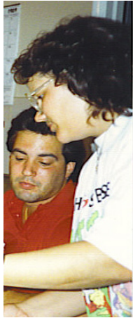
another day at mom's