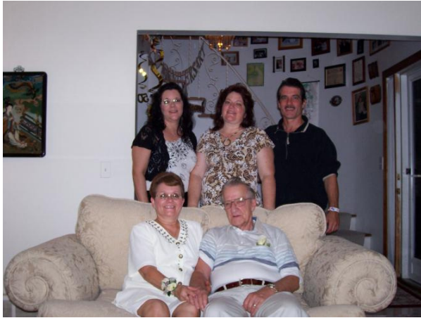
we missed you