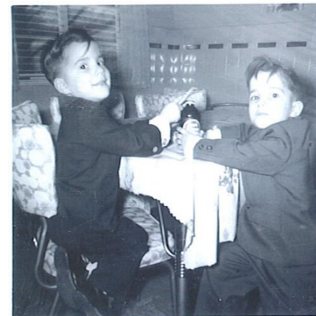
always into something