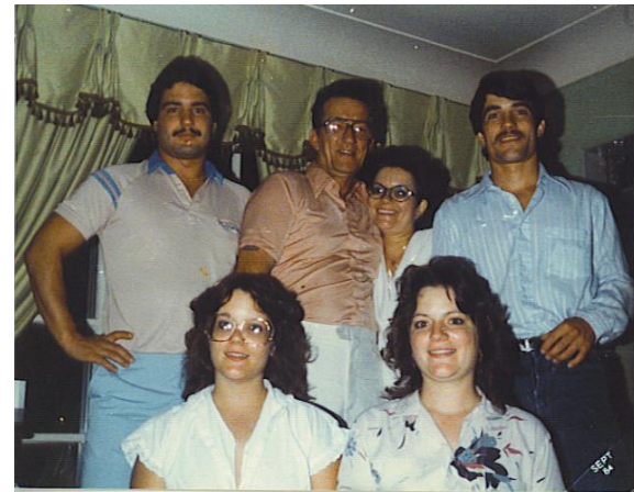
25 years ago