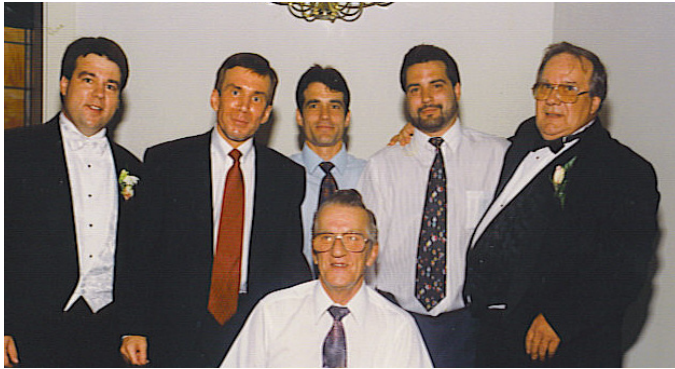
The Kowalewski Men