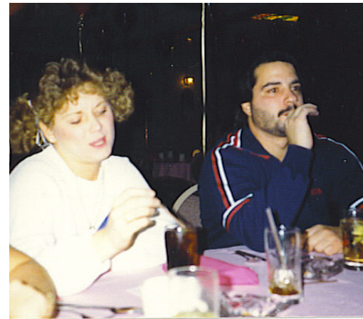
The other great love of his life