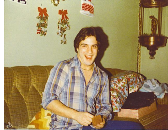
That contagious laugh