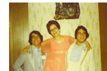
Giving Mom a little lift